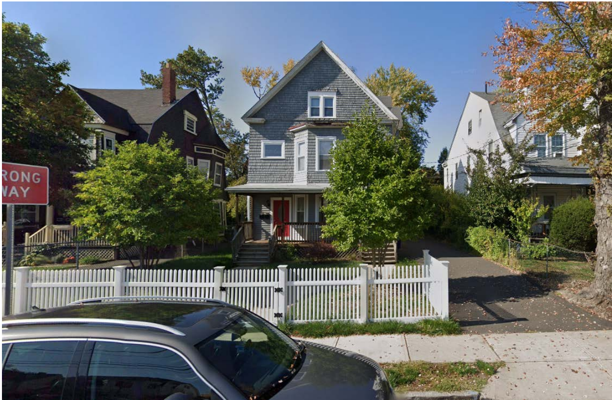
Front Façade from Magnolia Street – Google Streetview Image October 2020

Condition of other properties in neighborhood: Other properties on Marshall Street are in good condition. Many structures retain their original siding and historic character, though some windows have been replaced and siding covered.