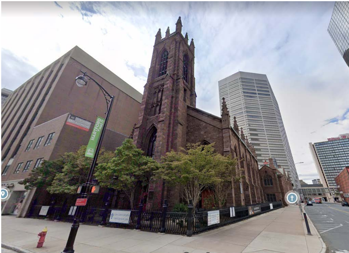
Fig. 1 - Main Street Frontage – Google Streetview, October 2020

Current Conditions: The exterior of the building is in excellent condition.