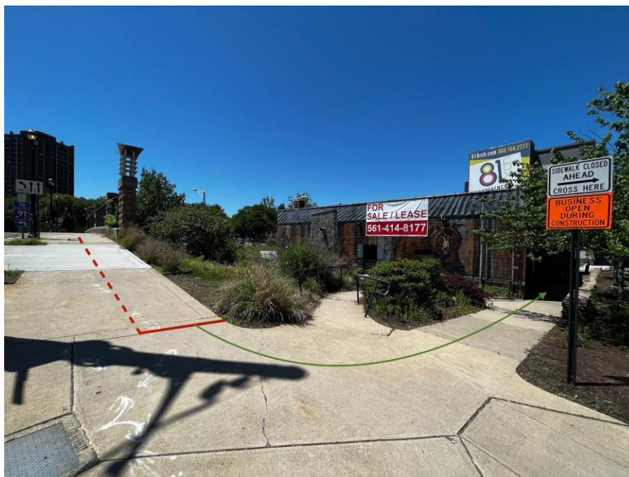
Figure 2. Proposed Pedestrian Overflow Queue Space – Greg Picuch 2022