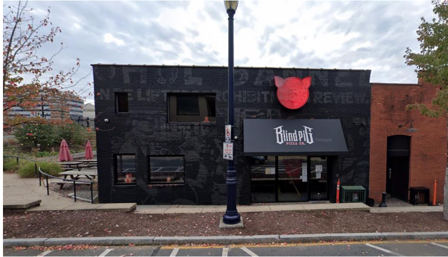
Figure 3. Subject Property as seen from Arch Street – Google Maps 2020